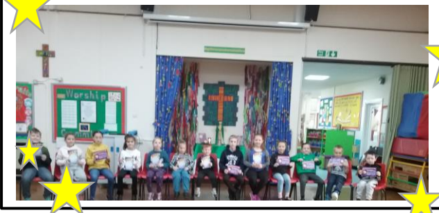
Star of the Week